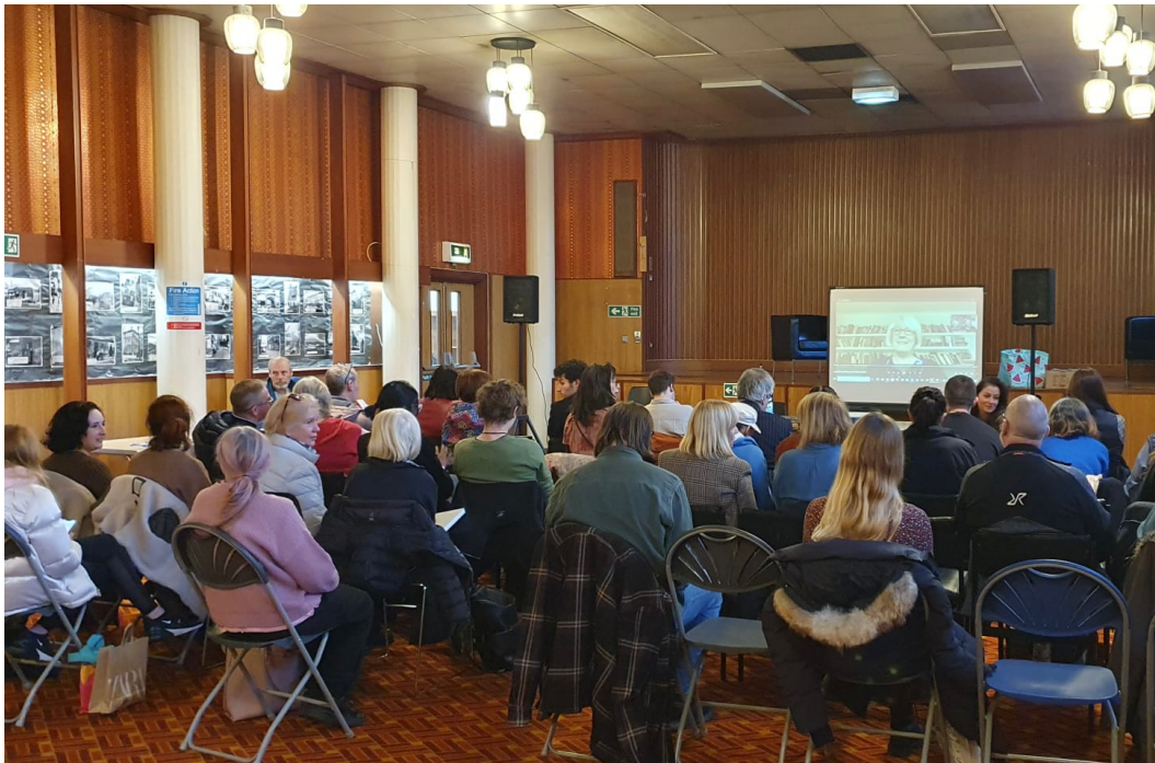
A good turnout at Hillhead Library

Ringwood was very excited to host a Short Story Seminar at Hillhead Library on Sunday October 22nd, and even more excited to see so many people attending and enjoying themselves.