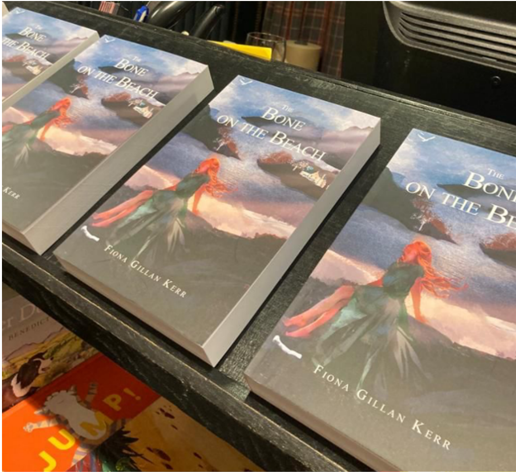
Copies of the Bone on the Beach available at Typewronger Books.

Missed out on these events? Don't worry – we have one more coming up! Rounding up our event schedule, we have our final launch event for the Bone on the Beach happening on the evening of the 14 th November in Glasgow, at the beautiful Arlington Baths.