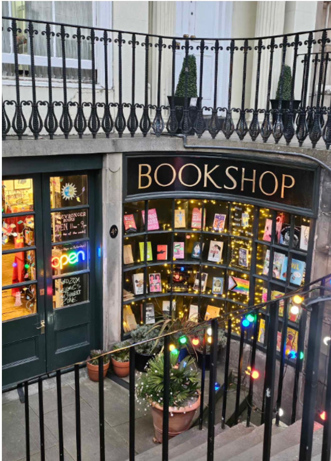
Typewranger Books in Haddington Place.